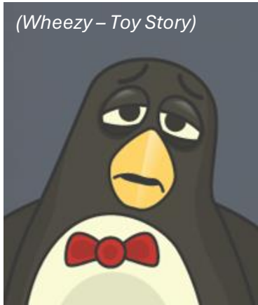
(Wheezy – Toy Story )