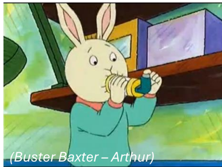
(Buster Baxter – Arthur )