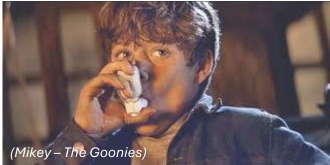
(Mikey – The Goonies )