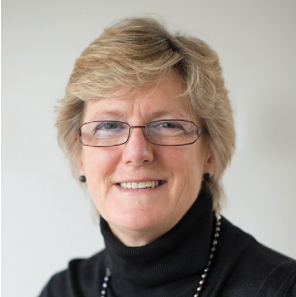
Professor Dame Sally C Davies Chief Medical Officer Department of Health & Social Care

Although many of us enjoy the sunshine, as a result of climate change we are increasingly likely to experience extreme summer temperatures that may be harmful to health. For example the temperatures reached in 2003 are likely to be a ‘normal’ summer by 2040, and indeed globally, countries have already experienced record temperatures. We do not know whether or not there will be severe heat over the course of this summer, but we do want to make sure that everyone takes simple precautions to stay healthy during periods of hot weather and when in the sun.